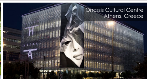
Onassis Cultural Centre Athens, Greece