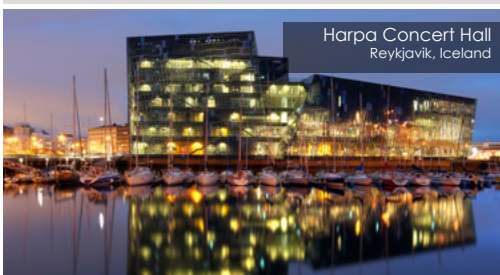
Harpa Concert Hall Reykjavik, Iceland

Big or small, near or far, Rapidrop provides solutions to the fire detection and suppression industry regardless of size or location.