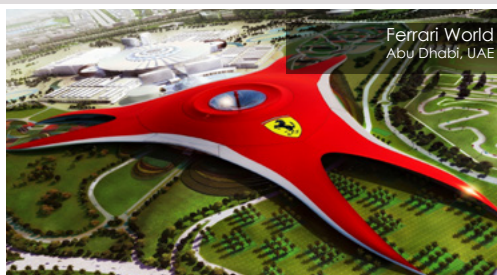
Ferrari World Abu Dhabi, UAE